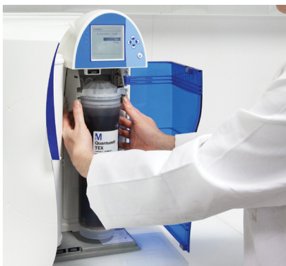
Progard® Pack replacement

Maintenance frequency is minimal, and the procedures are simplified.