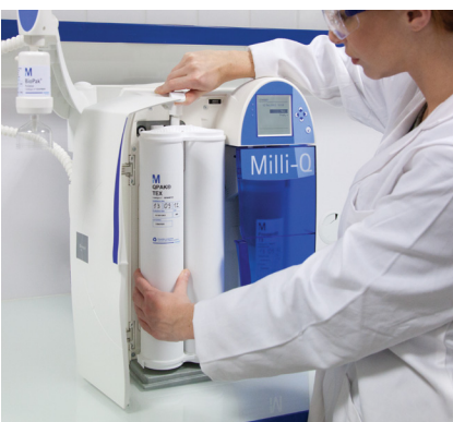
Q-Pak® polishing cartridge replacement