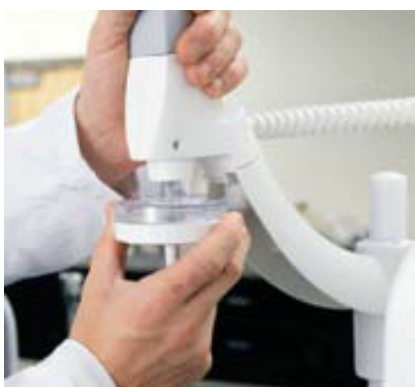
Millipak® Express 40 replacement